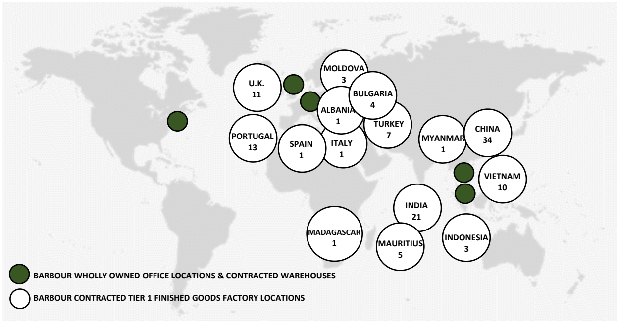
Table 3: Barbour's Tier 1 Global Map of Contracted Manufacturing Sites (April 2024)