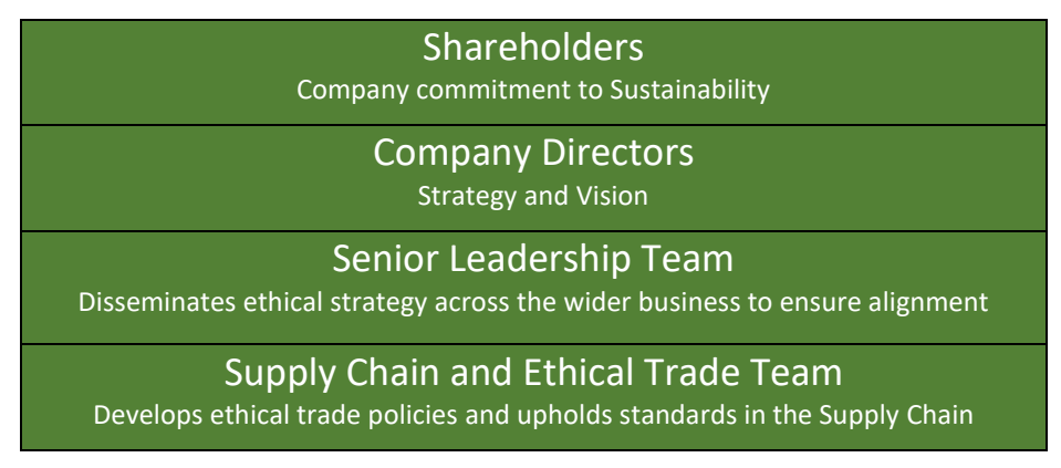
Table 1: J.Barbour & Sons Ltd. Governance Structure

Barbour is committed to the welfare, health and safety of all of our own employees and Business Partners, our contracted manufacturers, and to delivering socially responsible products to our customers.